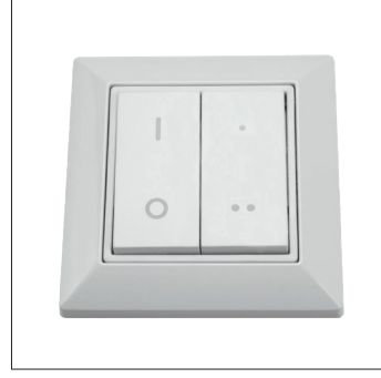
XCS wireless switch