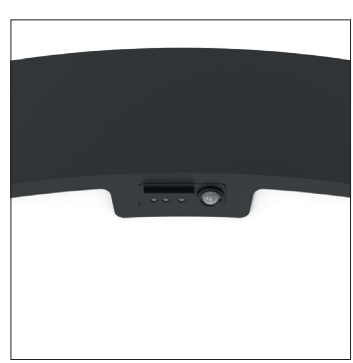
XC daylight&occ sensor

All current index numbers, lumen outputs, power consumption and many other technical information are available in our 2024 pricelist. Details on wireless lighting control systems on page number 896.