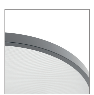
MP19H microprismatic diffusor