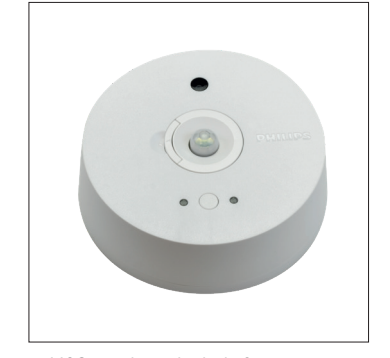
MCS wireless daylight&occ sensor