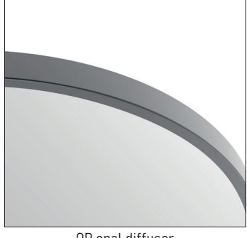
OP opal diffusor